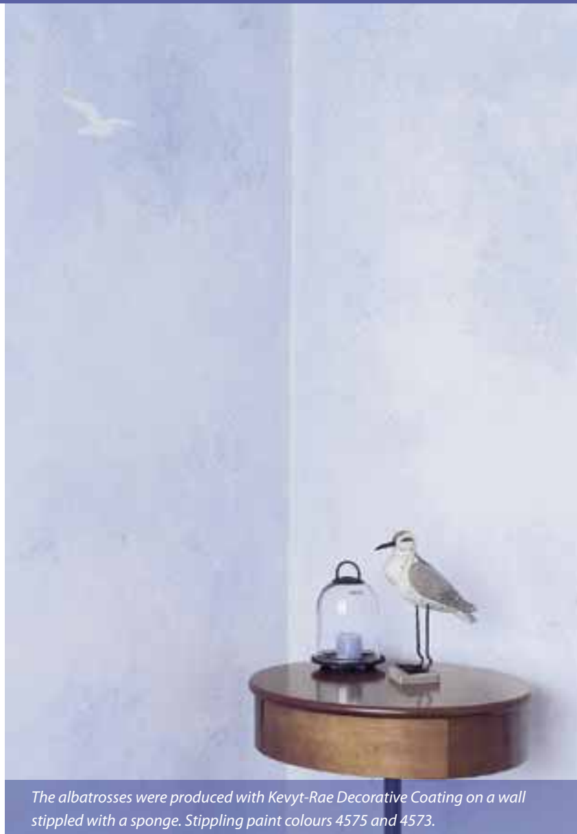
The albatrosses were produced with Kevyt-Rae Decorative Coating on a wall stippled with a sponge. Stippling paint colours 4575 and 4573.

Another feature that has attracted a great deal of attention in this villa is its "seagull room", where the walls feature a breathtaking summer sky. Plump albatrosses sail among the fair-weather clouds in the blue sky, bringing good luck to seafarers and giving wings to the dreams of the people who live in this house. This villa has room for dreaming.