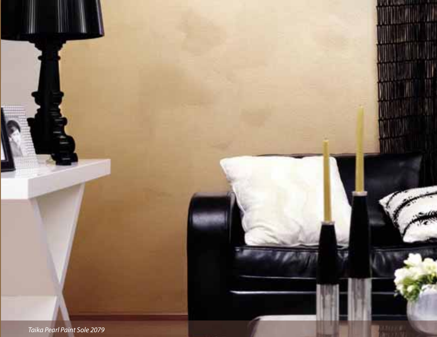
Taika Pearl Paint Sole 2079