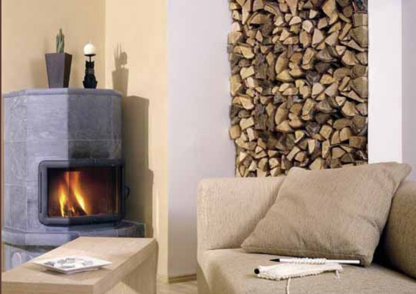
The gentle, watercolour effect of this fireside parlour was achieved with a colourwash of a porous Kevyt-Rae surface with Feelings Effect Paint, colour 4689.