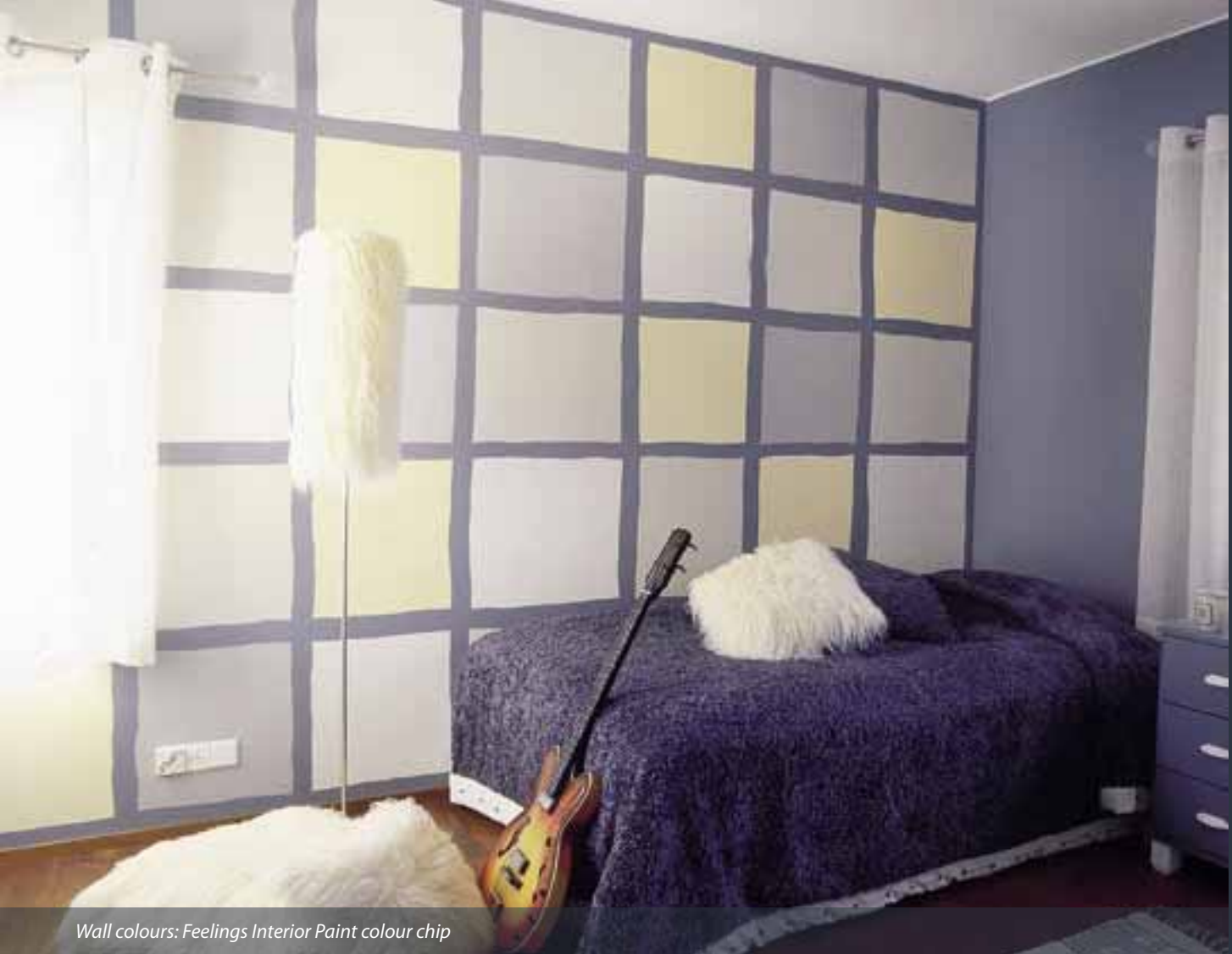
Wall colours: Feelings Interior Paint colour chip