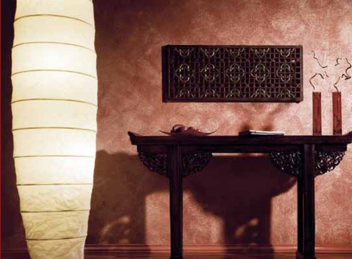
This warm Oriental look was created with a pattern roller and Feelings Effect Paint. Wall undercoat 4621, Effect Paint 4622.