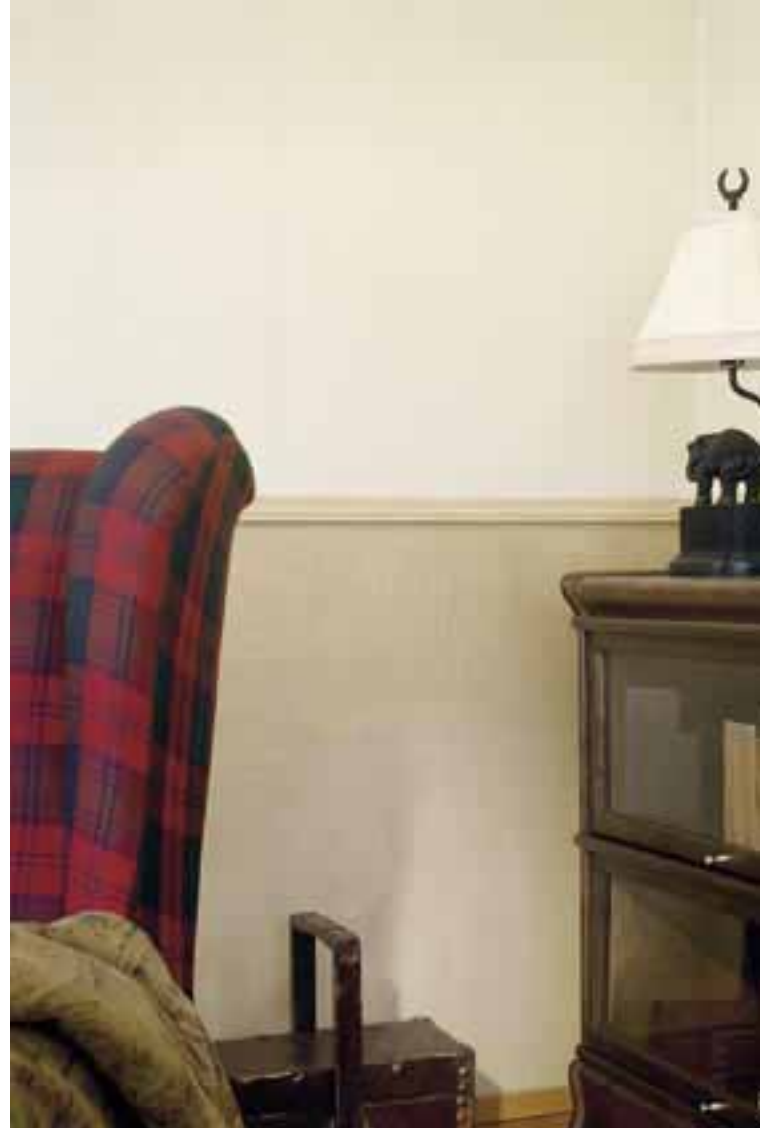
A Kevyt-Rae colourwashed with a sponge.