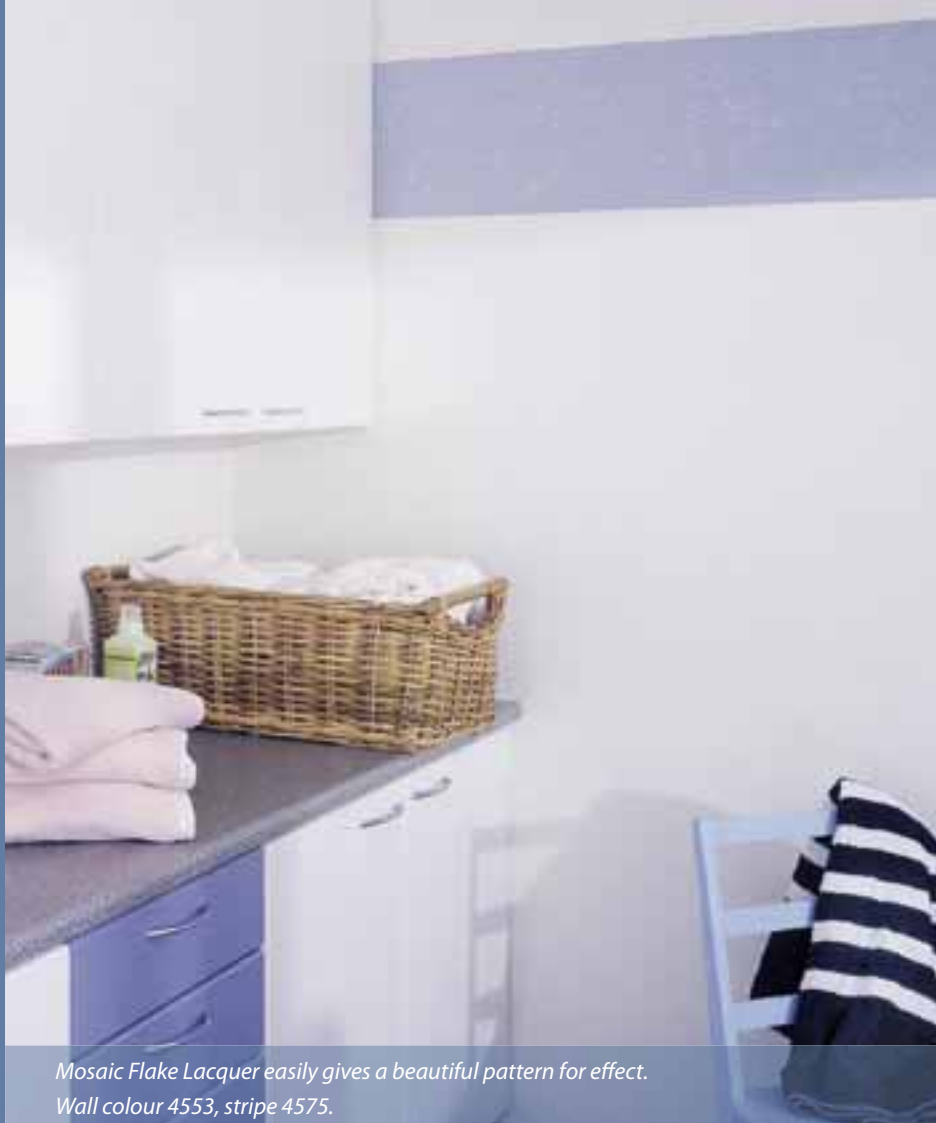
Mosaic Flake Lacquer easily gives a beautiful pattern for effect. Wall colour 4553, stripe 4575.